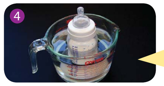
When it's time for a feeding, the formula should be warmed using hot tap water until it feels lukewarm (neither hot or cold).

Use a sterilized bottle for each feeding. You can make one or several bottles at a time. Ensure the formula can is clean and does not have any dents. Wash the lid of the formula can with a warm, clean cloth before opening.